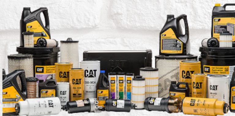
C.A.T Generator Spare Parts