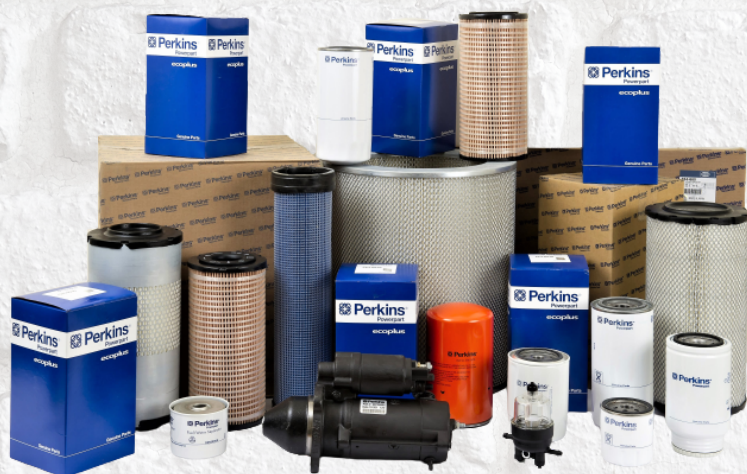
Perkins Generator Spare Parts