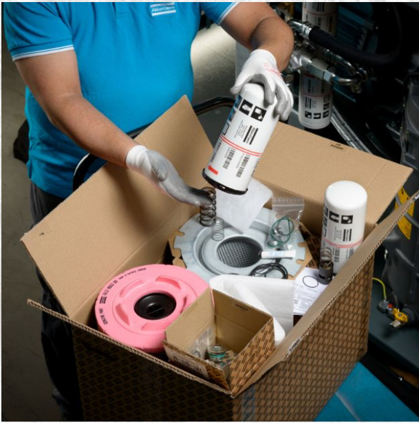
Compressor World Atlas Copco Service Kits