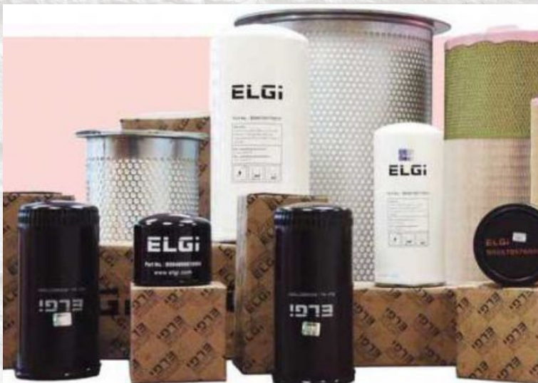
Compressor World Elgi Service Kits