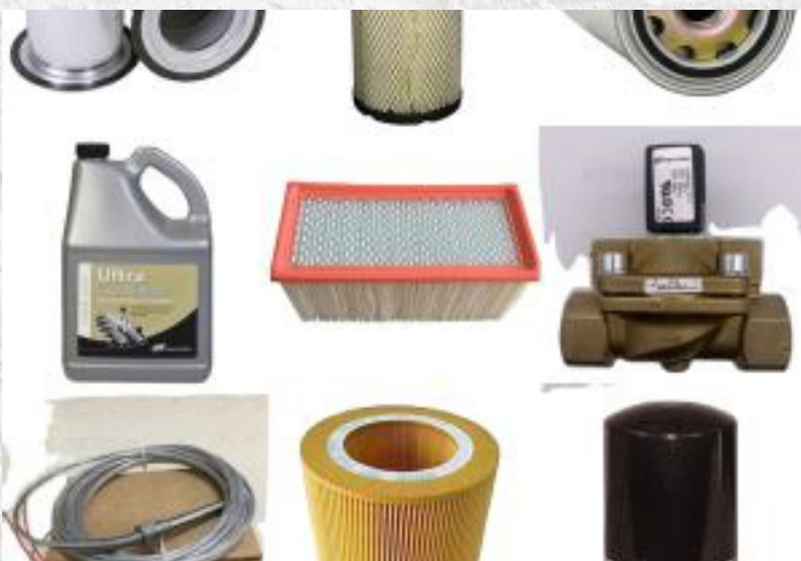
Compressor World Ingersoll Rand Service Kit