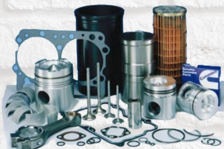
Cummins Generator Spare Parts