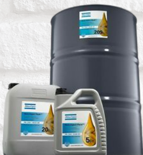
Atlas Copco Compressor Oil and Lubricants