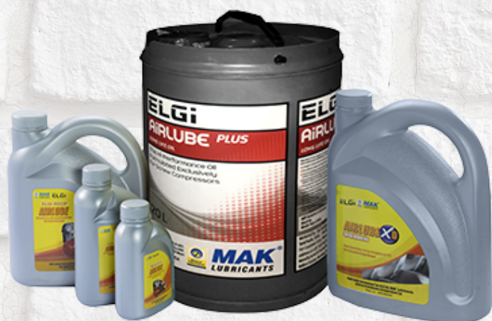
Elgi Compressor Oil and Lubricants