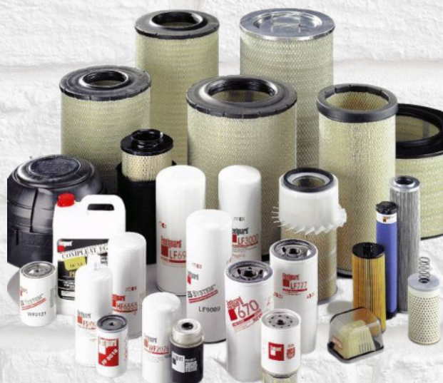
FleetGuard Generator Spare Parts