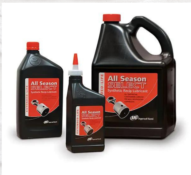
Ingreso Rand Compressor Oil and Lubricants